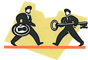
A Key To Retention